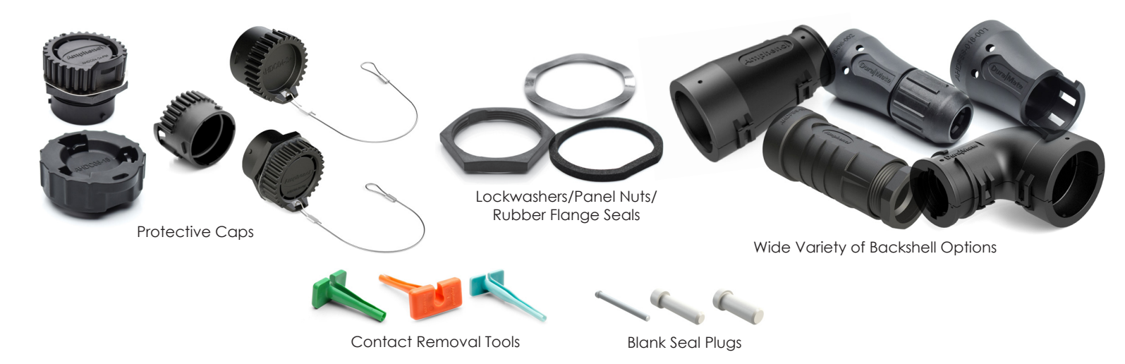
DuraMate™ AHDP ISOBUS 91 Series - Plug & Receptacle Options (Dimensions in mm)

DuraMate™ AHDP ISOBUS 91 Series - Backshell Options and Accessory Overview