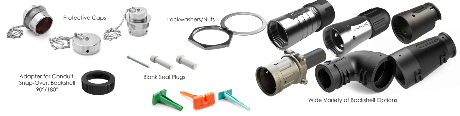
Contact Removal Tools