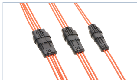
Squba 3.60mm-Pitch Sealed Connector Family, Fully Mated, 2 to 4 Circuits, with a Current of up to 14.0A