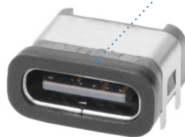
USB Type-C Receptacle, 6 Circuit (217176 Series)