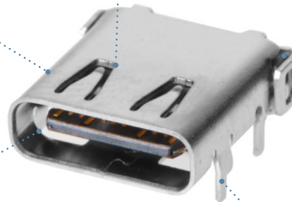
USB 3.2 Gen 1 Type-C Receptacle, Top-Mount, 24 Circuit (217183 Series)

Helps ensure high reliability while preventing damage from connector mishandling