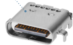
USB 3.2 Gen 1 Type-C Receptacle, Mid-Mount, 24 Circuit (217184 Series)