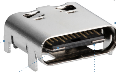
USB 3.2 Gen 2 Type-C Receptacle, Top-Mount, 24 Circuit (105450 Series)