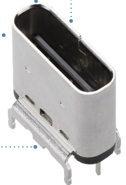
USB 3.2 Gen 2 Type-C Receptacle, Vertical, 24 Circuit (204711 Series)