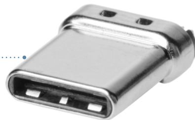
USB 3.2 Gen 2 Type-C plug, 24 Circuit (105444 Series)

Provides easy identification and differentiation against non-Type-C USB cables