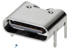
USB Type-C Receptacle, Top-Mount, 6 Circuit (217175 Series)

Long receptacle housing leads Is suitable for different PCB thicknesses to provide stable PCB connections