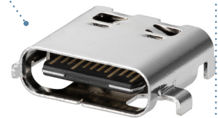
USB 3.2 Gen 2 Type-C Receptacle, Mid-Mount, 24 Circuit (105455 Series)