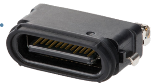
USB 3.2 Type-C Receptacle, 24 Circuit (202410 Series)