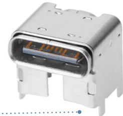
USB 2.0 Type-C Receptacle, Top-Mount, High-Center, 16 Circuit (217180 Series)

Low high-center line Is helpful in aligning high- center line positions