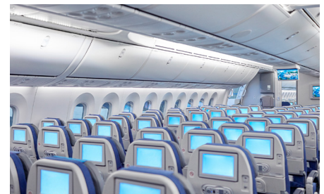
In-Flight Entertainment Systems