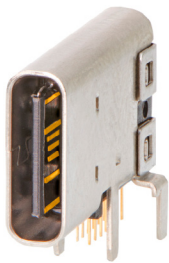
USB Type-C Receptacle, Upright, 14 Circuit (216989 Series)

Low-profile height Offers space savings and simple solder layout