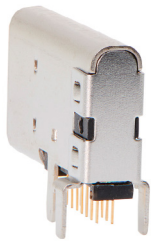
Slim Fit Design