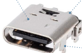
USB 2.0 Type-C Receptacle, Top-Mount, 16 Circuit (213716 Series)