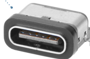
USB Type-C Receptacle, 6 Circuit (217177 Series)