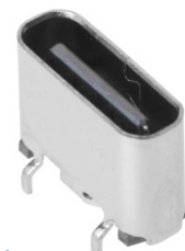
USB 2.0 Type-C Receptacle, Vertical, 16 Circuit (217182 Series)