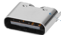
USB Type-C Receptacle, Vertical, 6 Circuit (217178 Series)

Long receptacle housing leads Is suitable for different PCB thicknesses to provide stable PCB connections