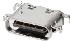
USB 2.0 Type-C Receptacle, Mid-Mount, 16 Circuit (216990 Series)